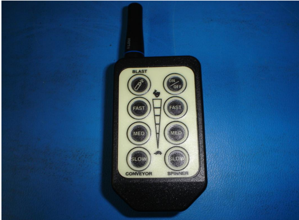
650 STANDARD TRANSMITTER

Shown above is a typical transmitter for wireless operation of a 12VDC motor. The button functions are as follows: